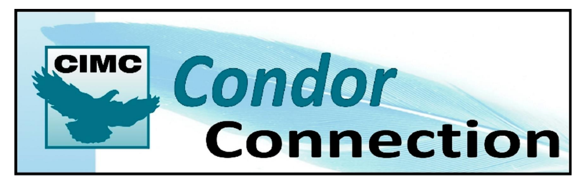
The CIMC Movement: Creating Positive Change for Native Communities